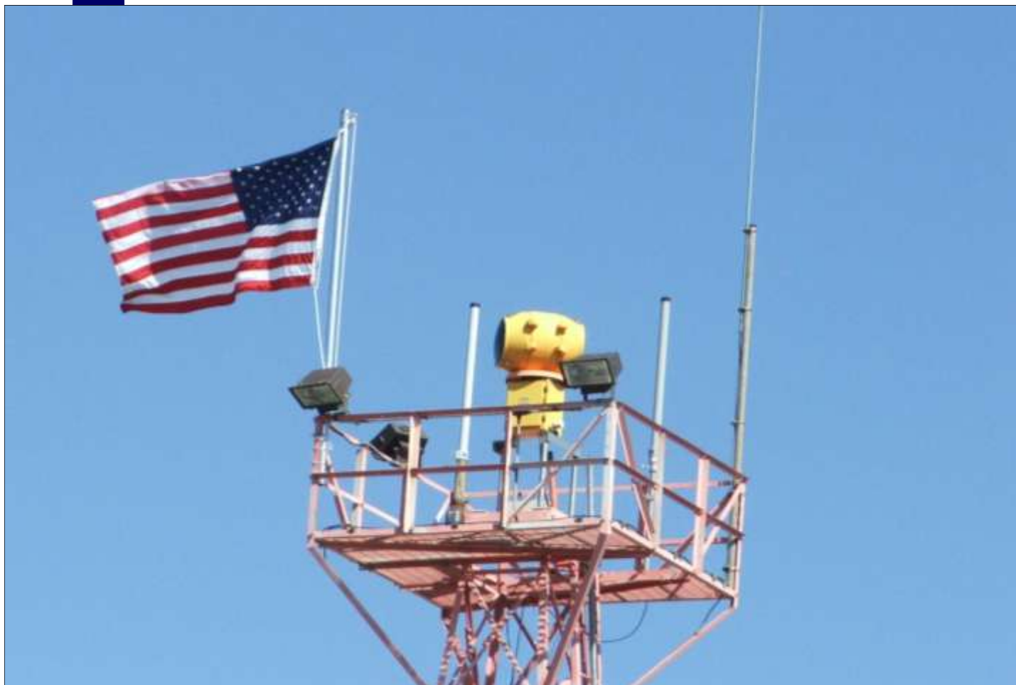
Old Glory flies high over Hicks Field on a beautiful Fall morning

The Greatest Hicks Airfield Related Newsletter On The Planet Almost 300 In Circulation Worldwide! November 2008